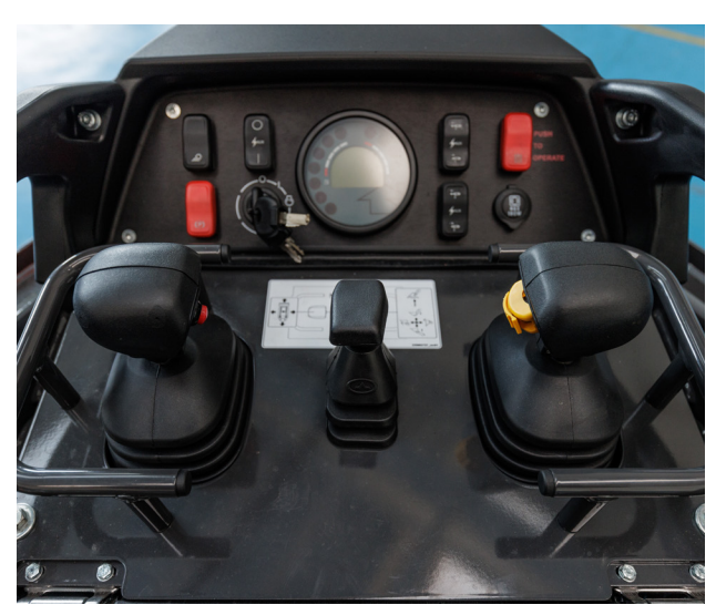
Control console with piloted hydraulic joysticks.

All equipment is activated by electrical and hydraulic controls on the control console (AUX 1 roller and optional push buttons). The front LED bar can be activated with one click from the dedicated button, while two clicks are required to activate the rear. Both provide visibility up to 25 m.