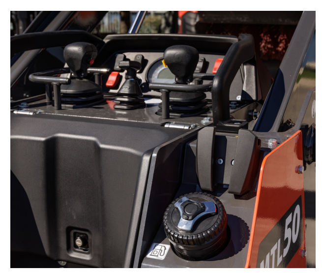
Two convenient object holders and two external support handles for added security.