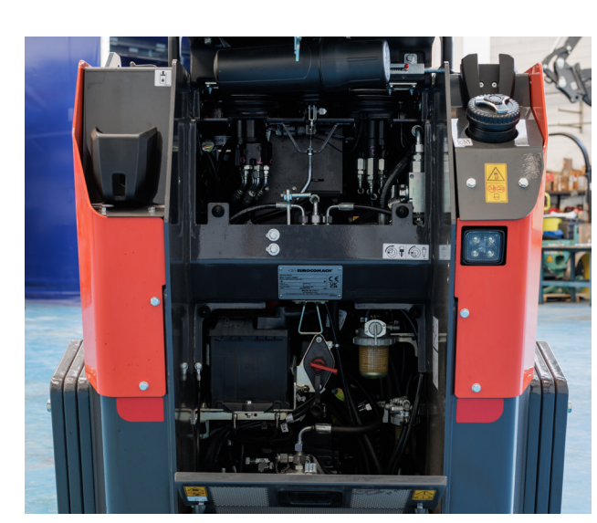
Rear access to battery and pump.

The four attachment points (2 at the front and 2 at the rear) facilitate safe transport of the machine on any type of vehicle.