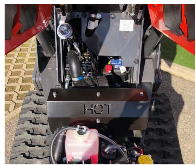
Front access to engine, air and fuel filters.